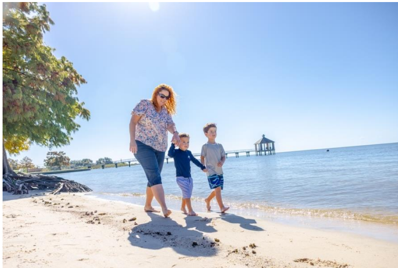
Fontainebleau State Park in Mandeville, Louisiana.

Mandeville, Louisiana (May 7, 2024) – As the official start of summer nears, the five waterfront towns that comprise The Northshore in Louisiana (look for St. Tammany Parish on your map) offer plenty of ways to stay cool. Located just 40 minutes north of New Orleans' French Quarter, The Northshore has been a favorite getaway since the 1880s, when visitors started being drawn to its picturesque towns, fragrant loblolly pines, relaxed environment, and deep-spring water that was believed to cure ills and calm nerves. Here you're never more than 15 minutes away from a source of water, including Lake Pontchartrain, the Tchefuncte or Bogue Falaya rivers, and Cane Bayou. So ... grab your sunscreen, don your favorite swimsuit or sundress, and choose which water adventure will best help you explore the coolest place in Louisiana, The Northshore.