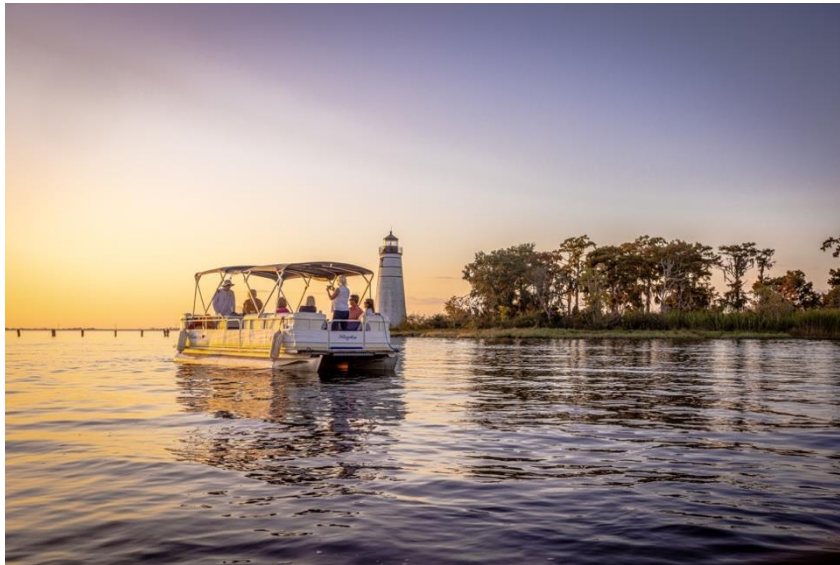
Louisiana Tours and Adventures cruise on The Northshore.

Paddle Away: The Northshore recently welcomed two new self-guided kayak experiences. Bayou Adventure offers paddling rental kiosks inside Fontainebleau State Park, and locally-owned Kayaks To Geaux delivers kayak rentals anywhere in St. Tammany Parish. If you'd prefer a guided paddle, Canoe & Trail Adventures has been servicing The Northshore for more than 45 years and offers both daytime and twilight-hour wetland tours guided by Louisiana master naturalists.