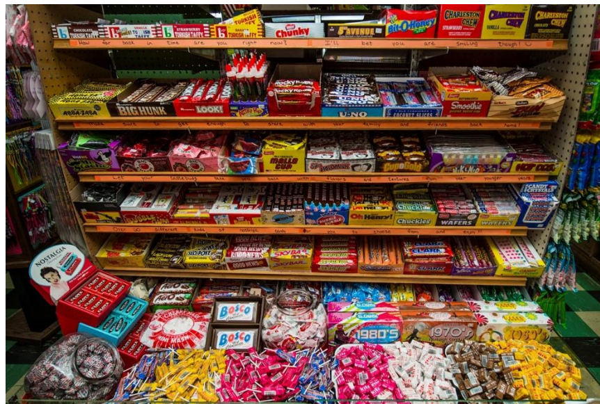
This is just a small segment of the candy on offer at Dick's 5 & 10.