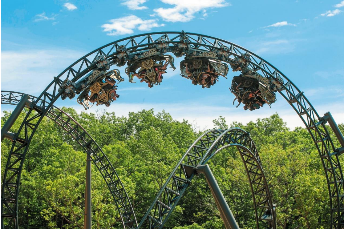
Time Traveler is an innovative roller coaster featuring vehicles that both spin and invert.

The park is closed right now, but we thought you might enjoy a virtual ride on Time Traveler . Here's some point-of-view footage that was shot when the coaster opened two years ago. (And I just gave you the answer to one of the trivia questions!)