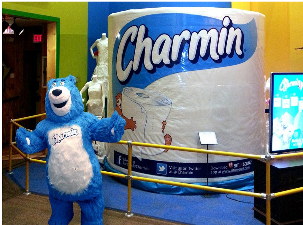
Believe it or not, the world's largest roll of toilet paper can be found at Ripley's Branson.

Speaking of fun facts, Branson's tourism office created an online trivia game so visitors and potential guests can test their knowledge about this small town (population = 10,000) with big appeal. I'm embarrassed to admit that even after countless visits, I couldn't get all the answers right. To test your knowledge, visit this link . (Hint: You stand a good chance of answering at least a few questions correctly if you read this week's entire note.)