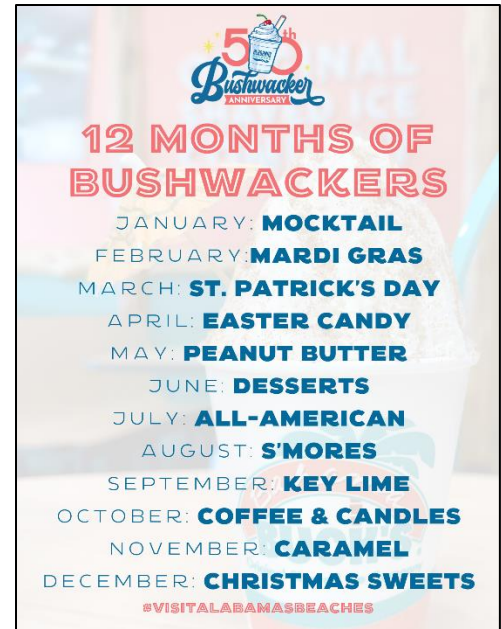
12 Months of Bushwackers features a different theme each month this year