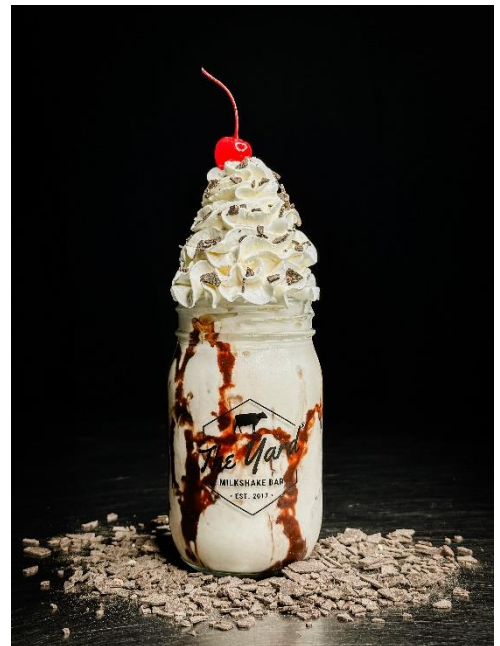
The Yard features a “Virgin Bushwacker Milkshake” on its Secret Menu

For the kids, teetotalers and the sober-curious, mocktail versions of this famous beverage can be found in various formats throughout the destination. On their “ Secret Menu ,” (scroll all the way to the bottom of the menu), The Yard Milkshake Bar offers a Virgin Bushwacker, featuring blended vanilla ice cream with chocolate drizzle. It’s topped with whipped cream, chocolate shavings and a cherry. At Bahama Bucks in Orange Beach, you can order up a bushwacker-flavored shake ... and a snowball fight on the side! The Bushwacker Sno features a Jamaican rum and white coconut flavoring combined with Chocolate Bahama Rama Mama (chocolate ice cream and tropic crème). A bucket of 60 SnoBalls that are freshly packed in a large cooler can be purchased separately for a fun-filled snowball fight at the beach. At High Tide Daquiris & Mimosas , beverage-seekers can order up a mocktail Bushwacker Flight.* The four-flavor flight includes classic, strawberry, banana and peanut butter bushwacker samples. The Hangout in Gulf Shores also features a mocktail version of the bushwacker* on its frozen cocktail menu year-round.